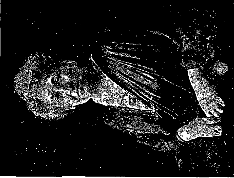
DR ALETTA JACOBS Head of the world's first birth control clinic in 1878