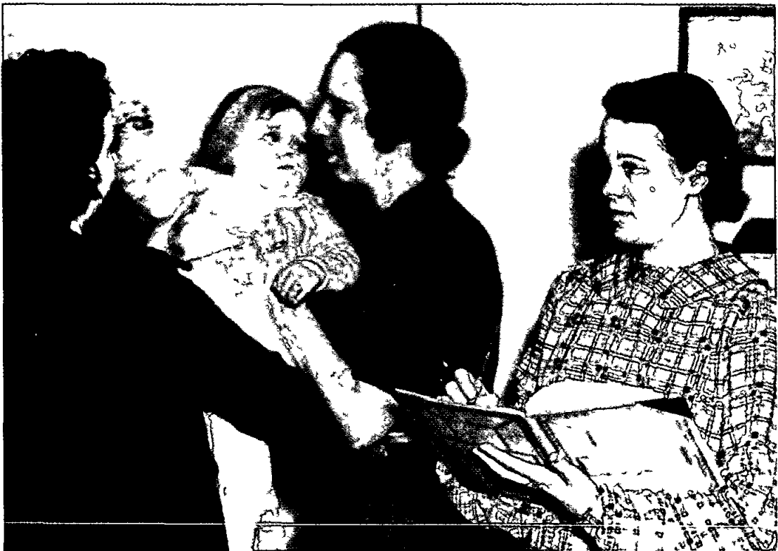
Babies are frequent visitors at the Maternal Health Center in Oklahoma City. Here a patient (left) leaves her baby in the care of the social worker as the care history is taken. Since it opened in June, 1937, the center has had 664 new patients, 446 of whom were mothers of families supported entirely or partly by relief funds. The average number of living children per patient was three.

The Federation has become an Institutional Member of the National Conference of Social Work, to be held in Buffalo next June, and will have a booth and conduct sessions at the Conference.