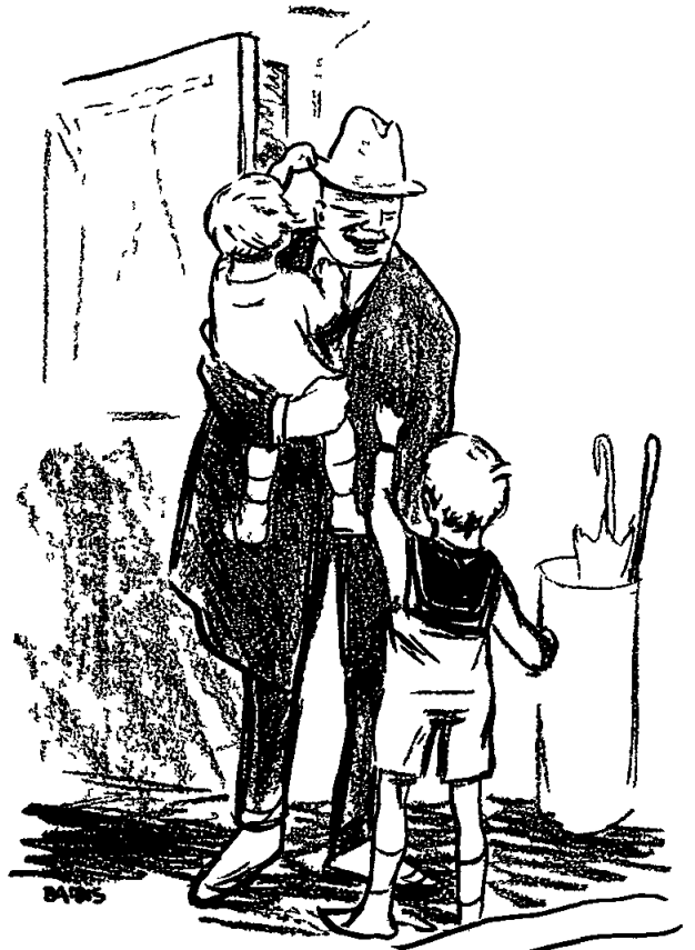
Judge Returning Home After Sentencing a Birth Control Speaker to Six Months Is Met by His Two Children, Ages Three and Six